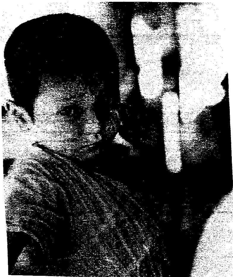
Karen refugee child photo, KHRG

Pang Sang militia (former communist rebels operating as SLORC militia) (one listing in multiple citations)