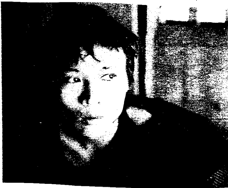
Karen refugee photo, KHRG

Col. Ne Win Oo ordered Column 2 of IB 18 to cut/destroy paddy in fields of two villagers.